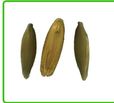
Figure 1 shows the oat kernel orientated so that the thinnest side is shown in the side view.

Corrections for rotation of the seed can be done to measure both the thinnest and thickest sides of the whole sample.